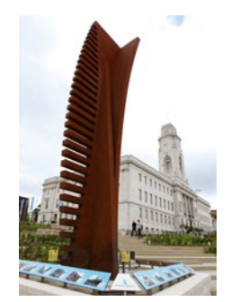
'Crossing (Vertical)' by Nigel Hall