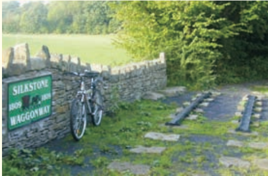
Silkstone Wagonway 1809

Information in this cycling guide can be made available in large print. This route is being assessed for mobility and sensory impaired users.