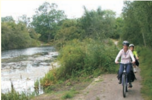
Trans Pennine Trail/ Disused Barnsley Canal

1 Start opposite Royston Police Station on Station Road and go down Warren Walk along a cycleway between the Royston Comprehensive School playing fields. 2 Carry on across the top of Milgate Street. 3 Turn right down Victoria Road towards Midland Road. 4 Cross the road (with care) into Park View; go down the hill to Church Hill. 5 Turn left, go along Church Hill and continue past Meadow Road; after a short distance turn left through the 'A' frame barrier to go along the canal towpath. 6 Cross Midland Road (with care) and look out for the Interpretation board next to the roadside. Continue along the canal towpath going past Whincover ( this area was a canal basin where coal was loaded from Monkton Collieries ). 7 Go through an 'A' frame and down across the end of the canal, follow the track through to another 'A' frame and continue on to Notton Lane at Old Royston. 8 Go through the barrier and turn left down Notton Lane (with care) and be aware of traffic. 9 At the 'Oliver Twist PH' crossroads, turn left along Bleakley Lane. 10 At the junction with Summer Lane, where the old railway abutments are, turn left onto Station Road. Continue along until you arrive back at the Police Station, the start of your ride.