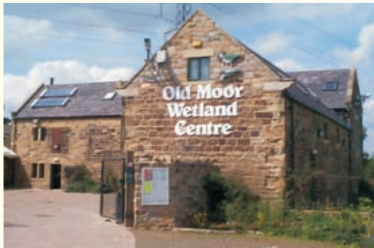
Old Moor Wetlands Centre

Information in this cycling guide can be made available in large print. This route is being assessed for mobility and sensory impaired users. For further information please contact BMBC Planning and Transportation Service on 01226 772655.