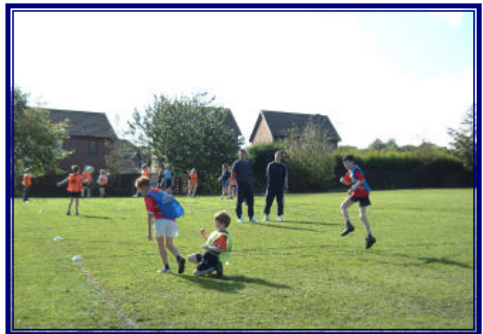
Children working with Barnsley Football Club

Parents are invited to be involved in work being undertaken at school. Class teachers and the Headteacher are available for consultation at any time. It is not necessary to wait for the school open days, which are held twice a year or Teacher Surgeries which are held once per half term.