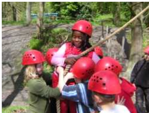
abseiling, archery and canoeing.