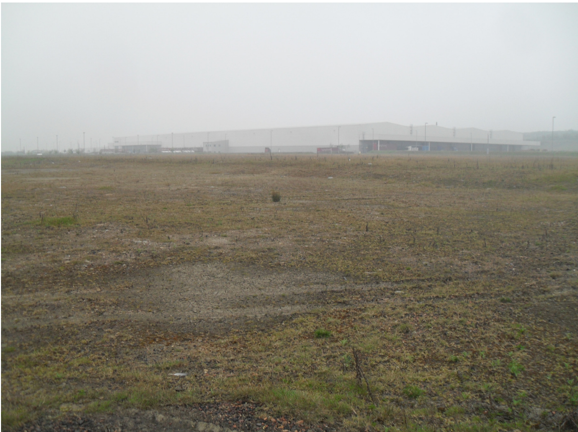
Photo C2.2 View over grassland.