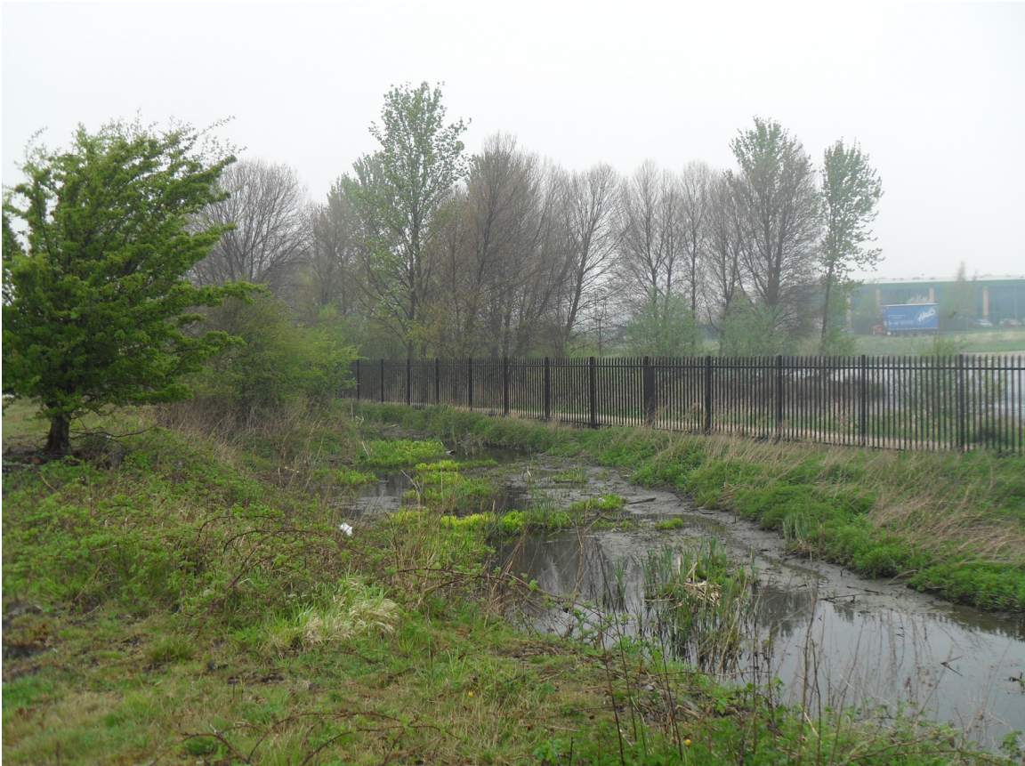
Photo C2.1 Stream on site's eastern boundary.