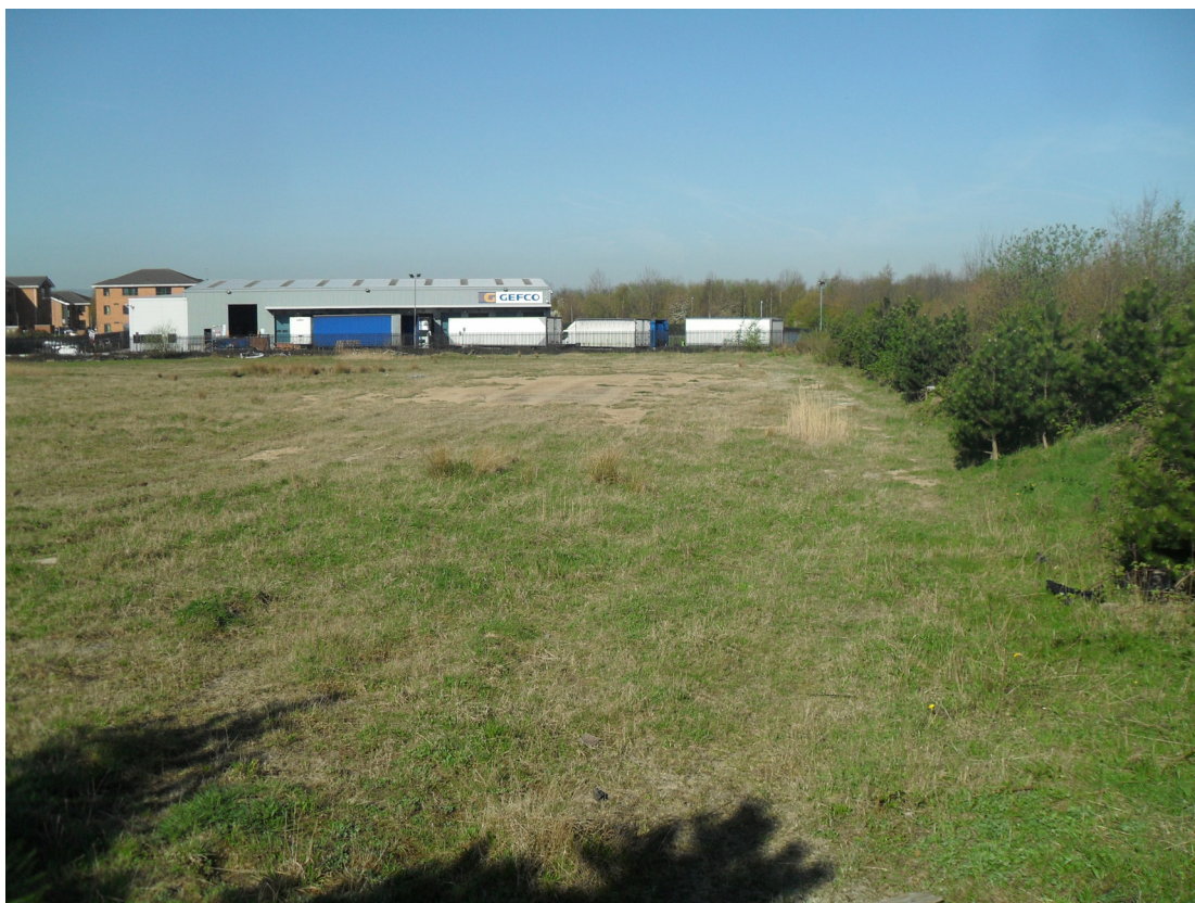
Photo D2 1. View over site.

The earth banking to the south and east of the site is young plantation woodland, with a mix of Scots Pine ( Pinus sylvestris ), Silver Birch ( Betula pendula ), Hawthorn ( Crataegus monogyna ) and Willow ( Salix sp.) The canopy is not closed and rank grassland and Bramble ( Rubus fruticosus ) provide ground cover.