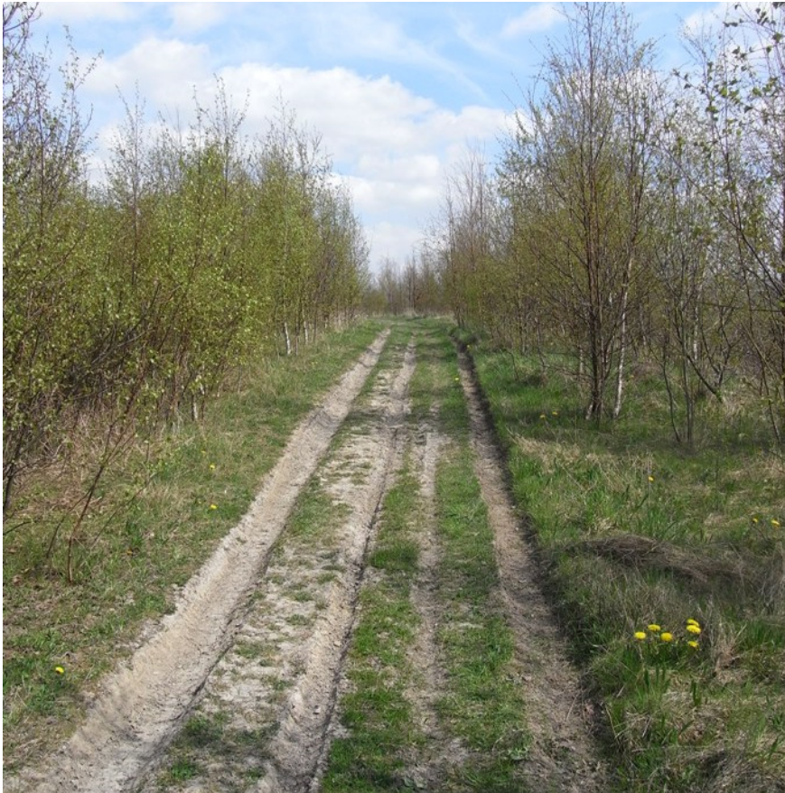
N2.4 Track along west edge