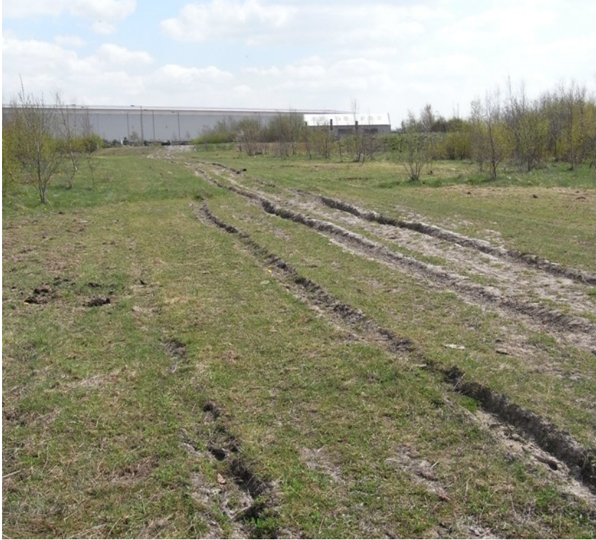
N2.3 Track to the south