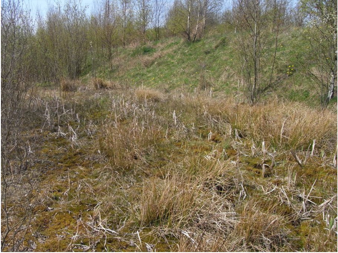
N2.1 Marshy grassland