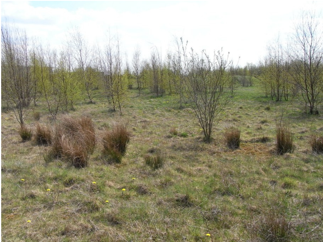
N2.2 Semi-improved grassland