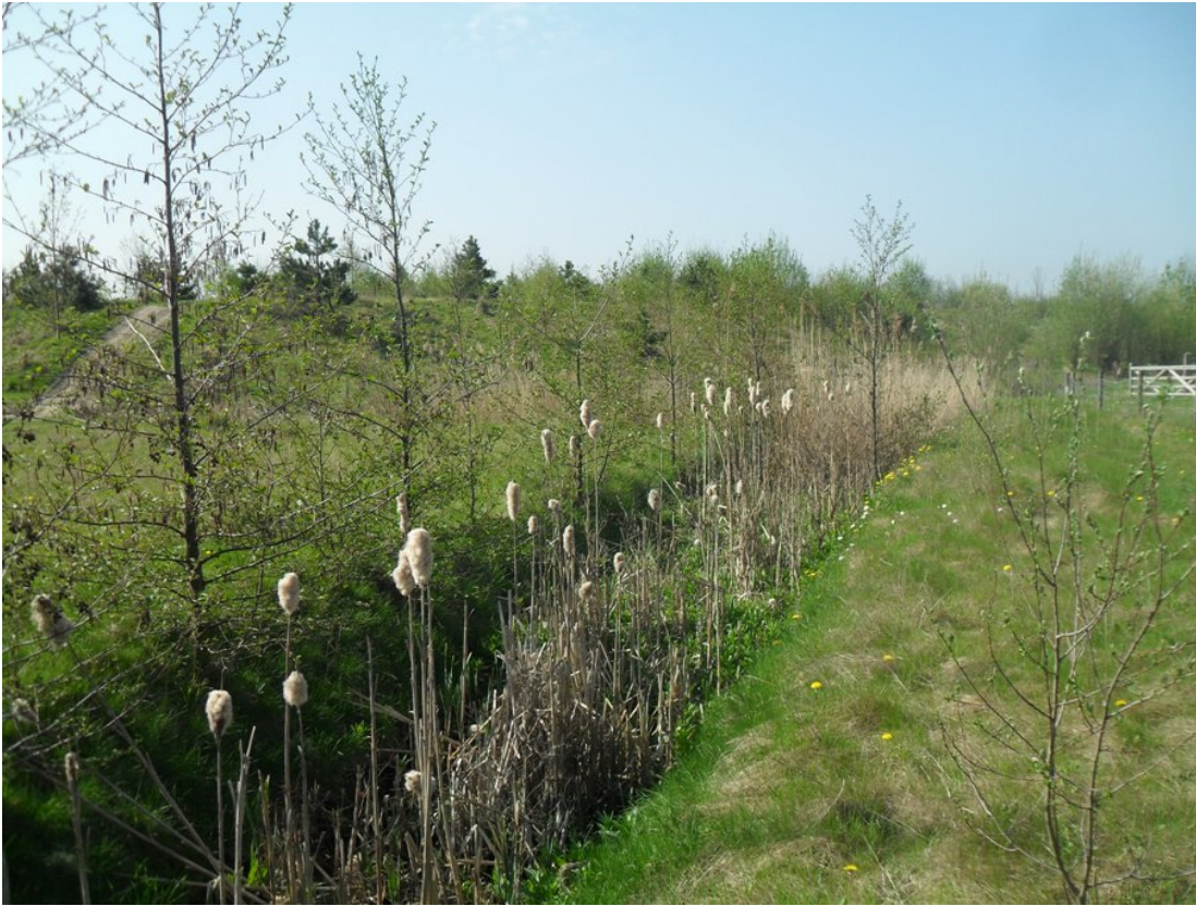
Photo N5 3 Ditch.