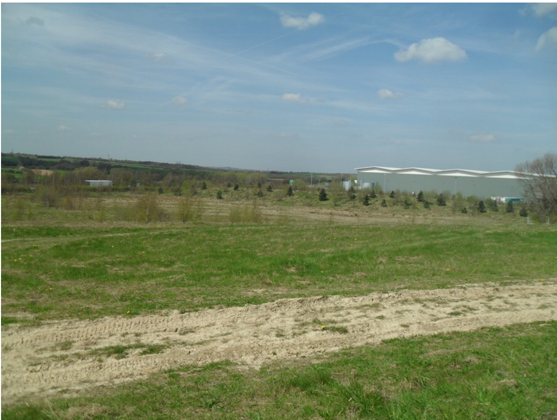
Photo N5 2 View across centre of site.