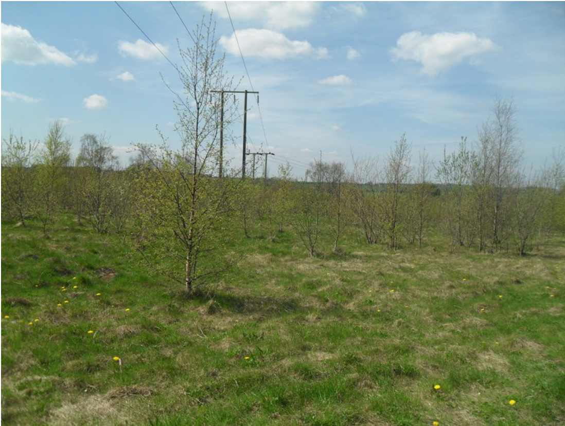
Photo N5 1 Semi-improved grassland with birch scrub