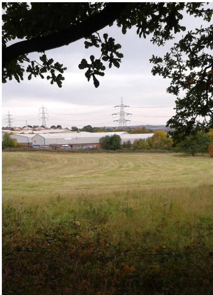
UB3.01 Semi-improved grassland