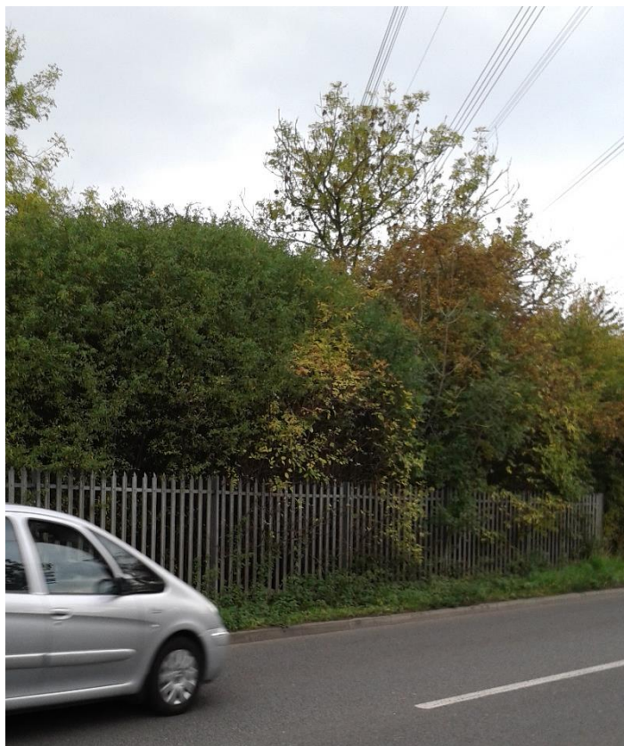
UB3.02 Strip of scrub and trees along road edge