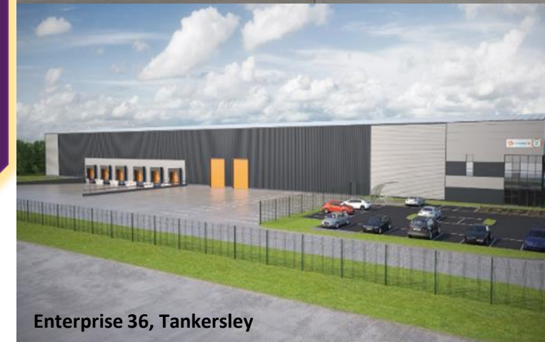
Enterprise 36, Tankersley