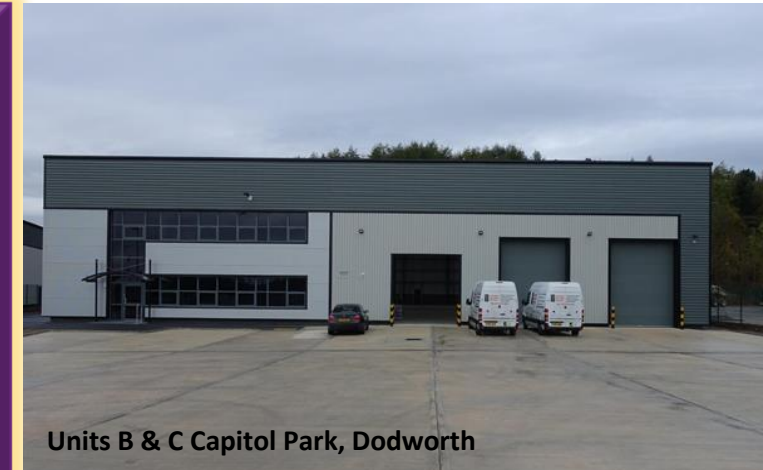
Units B & C Capitol Park, Dodworth