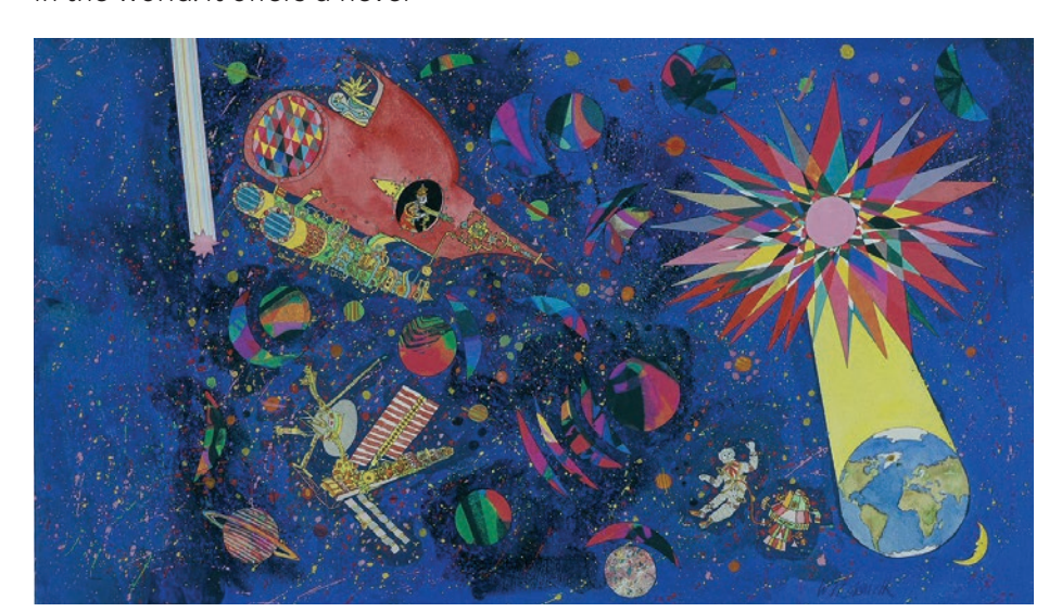
The Amazing World of Words – Space © The Brian Wildsmith Estate, 2024. Reproduced with permission of The Brian Wildsmith Estate and Oxford University Press.